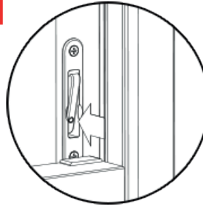
Disengage window opening control device