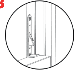
Lower bottom sash. Opening control device resets

To manually re-engage window opening control device