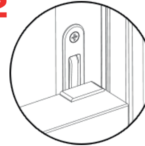
Raise bottom sash